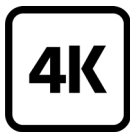
4K Ultra HD

Future-proof your wedding with 4K Ultra HD pixel resolution. Four times the size of standard high-definition, 4K Ultra HD is 3840 x 2160 pixels. And we never upscale footage. A 4K Ultra HD upgrade means that we shoot, edit and deliver in true 4K.